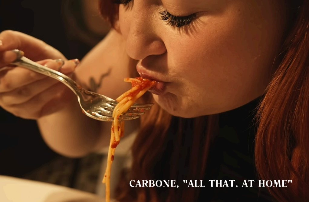
CARBONE, "ALL THAT. AT HOME"