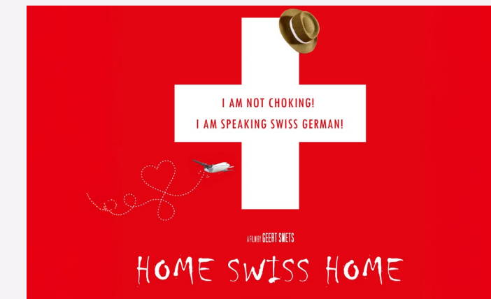
HOME SWISS HOME

Gold – SDVA Award Gold & Silber – BOSW Awards Bronze – ADC Award Bronze – Cannes Lion